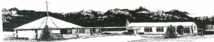
SPARTA UNITED METHODIST CHURCH, 71 Sparta Ave., Sparta, NJ 07871