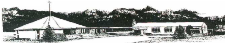
SPARTA UNITED METHODIST CHURCH, 71 Sparta Ave., Sparta, NJ 07871