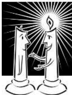
Jesus Is the Light