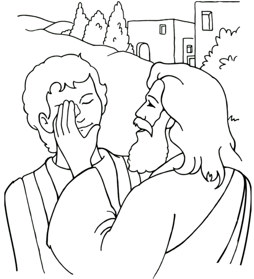
Jesus heals a blind man. John 9