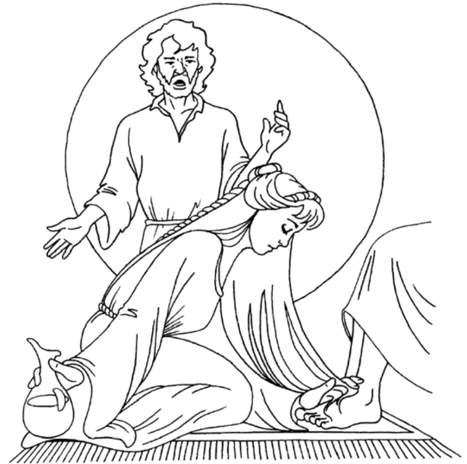
Mary Anoints Jesus' Feet John 12:1-8